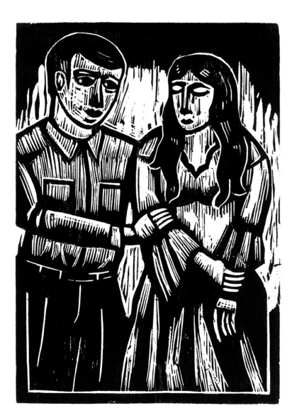
"Woman, behold thy son!" . . . "Behold thy mother!" JOHN 19:26-27(KJV)