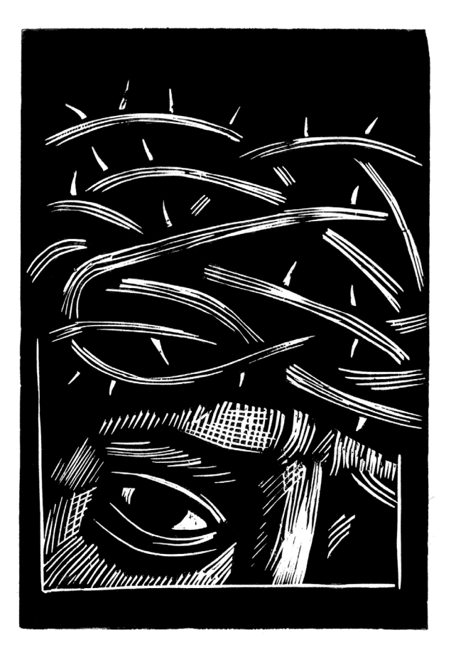
"Father, forgive them; for they do not know what they are doing." LUKE 23:34