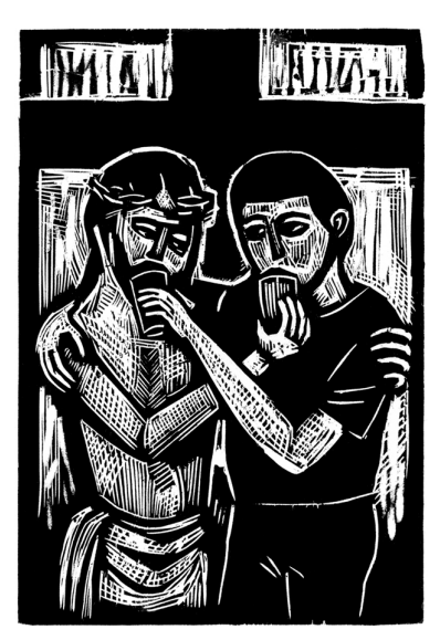
"I thirst." JOHN 19:28 (KJV)