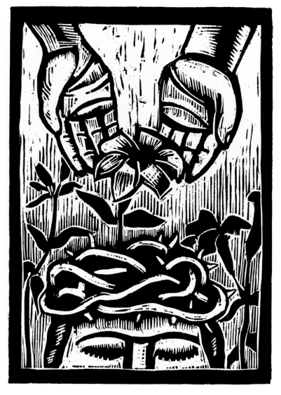
"Father, into your hands I commend my spirit." LUKE 23:46