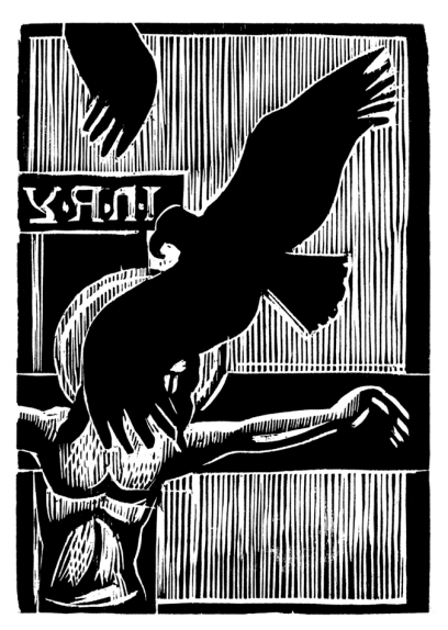
"My God, my God, why have you forsaken me?" MATTHEW 27:46