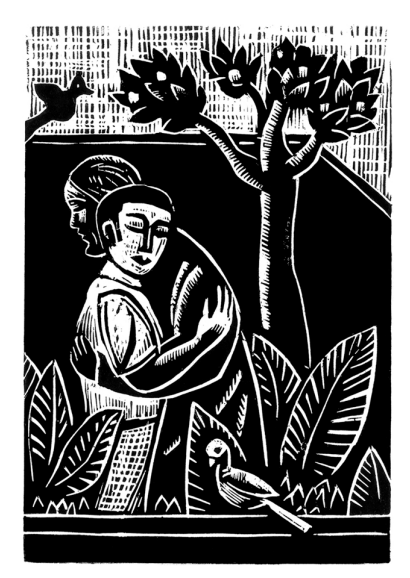
"Truly I tell you, today you will be with me in Paradise." LUKE 23:43